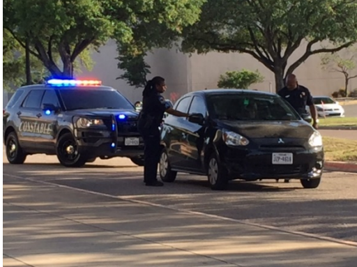
Pictured: Travis County Constable Officers acting out a traffic stop with some actors provided by ACC (Austin Community College)

On April 19 th , the DES staff attended the first filming session for the video of instructions on interaction between peace officers and civilians in response to SB30. A meeting will be held with the workgroup on April 26 th , in Florence, to preview a rough draft.